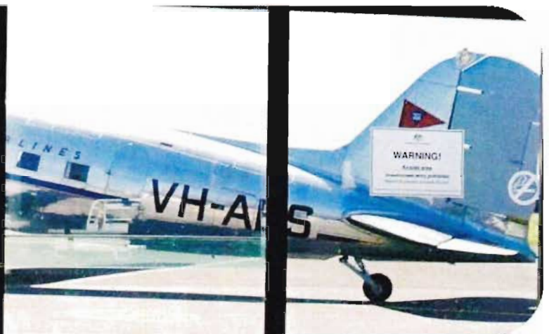
VH-AES 'Hawdon' on the ramp at Warnambool awaiting it's passengers for the return trip to