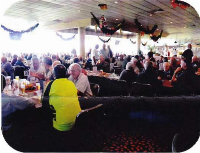
Everyone enjoying the meal and a chat with old friends.

The photo's below (thanks Kevin) captured some of those attending: