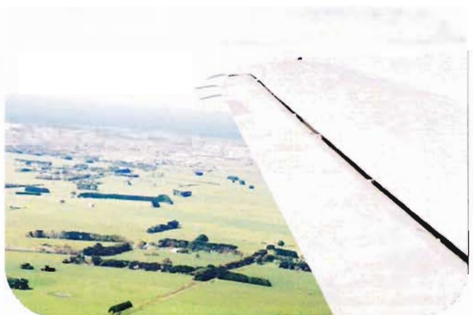
The view out the window towards the coast as the aircraft approaches