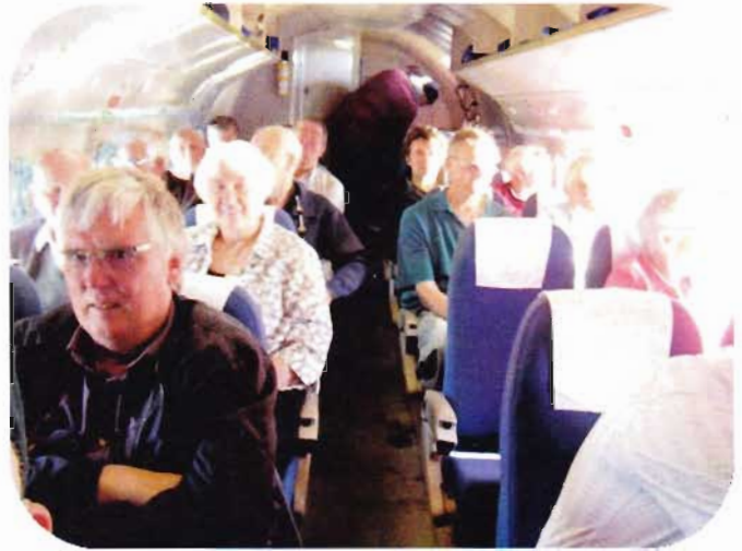
Everyone 's ready to go on the flight to Warnambool. A great time was had by all, and the aircraft operated perfectly.