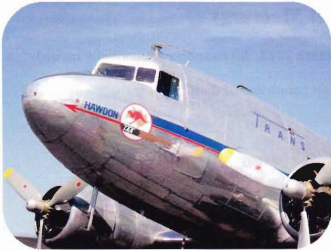
VH-AES 'Hawdon' – an original TAA DC3, all ready to go from Melbourne with our 25 Year Club members.