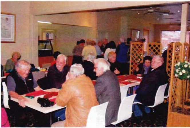
Enjoying lunch at the Golf House Hotel