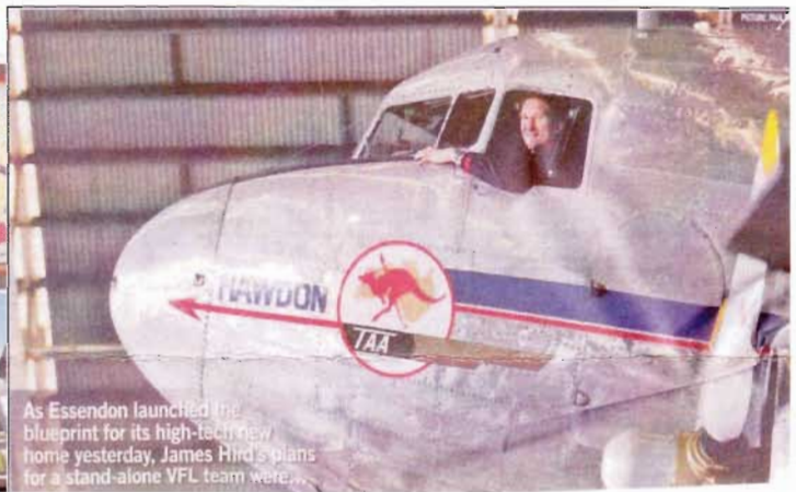
Essendon Coach James Hird in the Captains seat of VH-AES 'Hawdon'