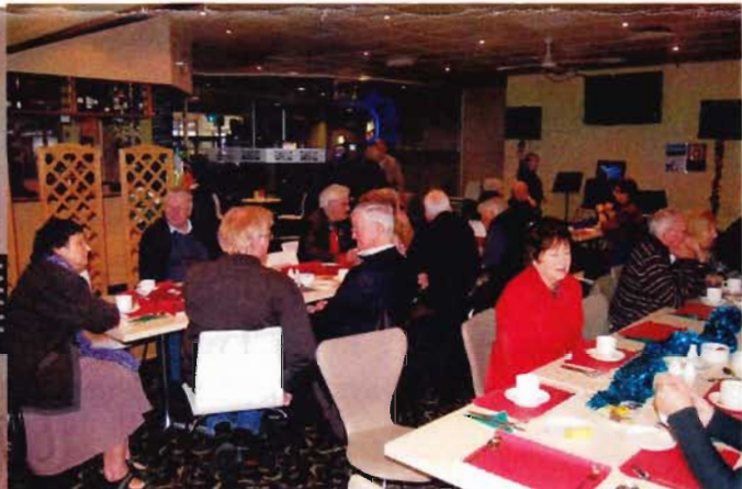
Another photo of the Golf House Hotel at coffee time