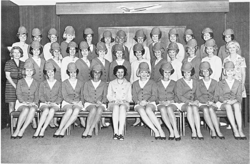
Hostess school 223 – Graduated in September 1970

Slowly we have been able to recover many photographic records of the staff who passed through the ranks of TAA, and again expanding our collection which is becoming a major interest for people who visit or have requests concerning people and the experiences of the second half of the 20 th Century.