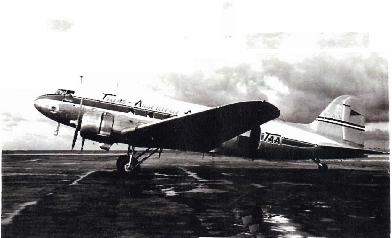
The first aircraft type in TAA (2 nd ) colours – VH-AES 'Joseph Hawdon'

This is a significant year in Australian Aviation history because it celebrates the birth of Trans-Australia Airlines in 1946 and reaffirms the slogan 'TAA The Friendly Way', now cemented into the annals of our heritage. We were and are the 'do'ers' - not 'gunna's', and remain a unique identity within the Australian community.