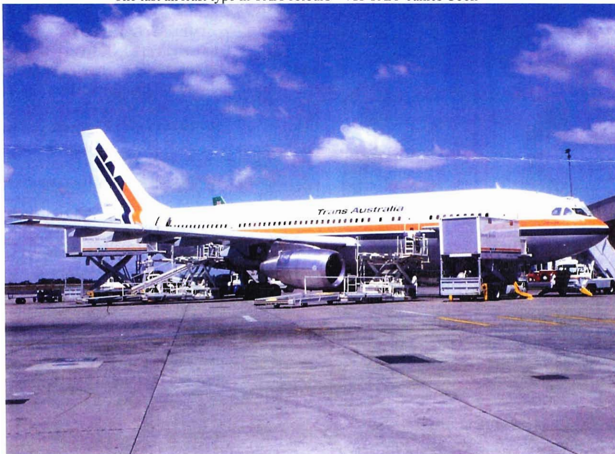
The last aircraft type in TAA colours - VH-TAA ‘James Cook’

If you intend to attend, then you should bring a boxed or picnic lunch. A birthday cake will be provided and we have, with the permission of QANTAS, use of the Tullamarine Maintenance Base cafeteria close to the aircraft.